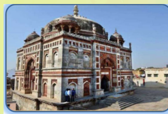
6. Tomb of Ibrahim Khan Suri

Famous Durga Mata temple located in Basai village of Mahendragarh district.