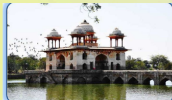
2. Jal Mahal

The temple is dedicated to Lord Hanuman and located on Narnaul-Singhana road surrounded by Aravali hills.