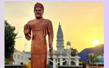
4. Baba JAIRAM DASS Mandir, Pali

Temple dedicated to Hanuman with Shiva temple and sacred tank at the top of Dhosi Hill.