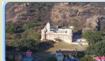
3. Temple at Dhosi Hill

Palace structure built in the center of a pond by Shah Kuli Khan.