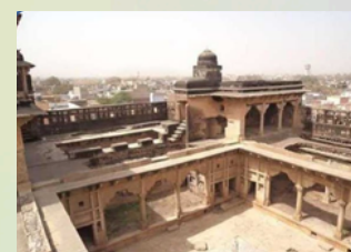
7. Birbal Ka Chhatta

Mausoleum built during Sher Shah Suri's reign in Narnaul.