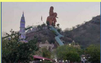
1. Baba Hanuman Mandir, Khalda

The temple is dedicated to Lord Hanuman and located on Narnaul-Singhana road surrounded by Aravali hills.