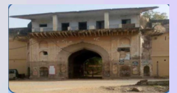
8. Mahendergarh Fort

Largest historical monument in Narnaul known for Mughal architecture.